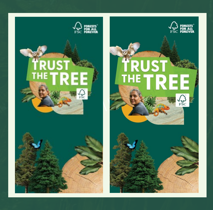
Roll up banners